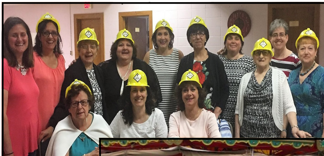
Left: "Demolition Day" coffee hour to kick off Kitchen Renovation Project, June 10.